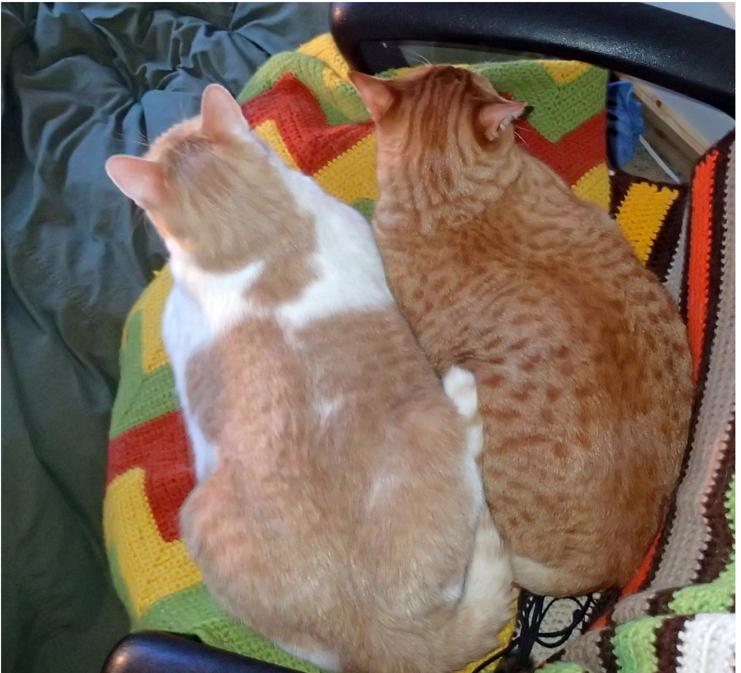
(with Mr. Q; top view; note Fran's zigzag pattern and subtle orange spots & stripes & white spots)