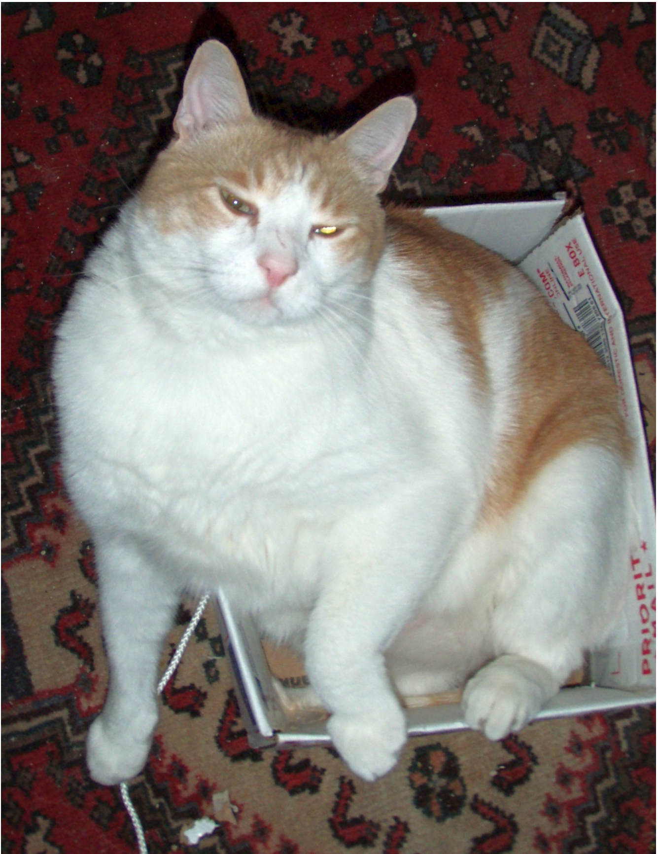
(cannot fit in all box sizes but may try anyway)