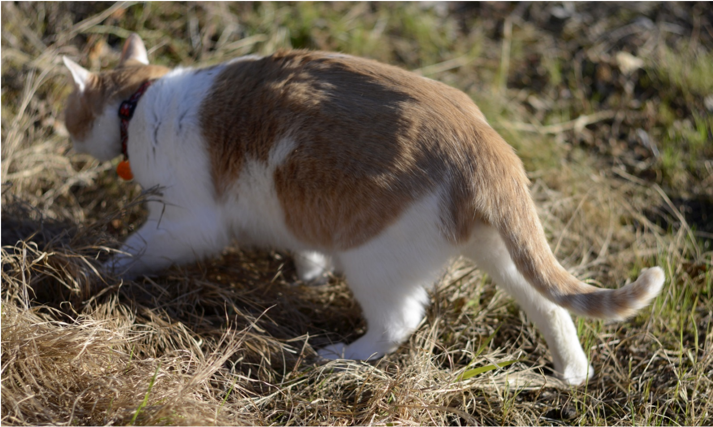
(left side flank view)