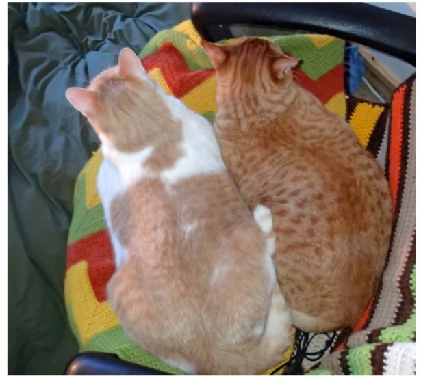
(4-in-1 image set 2)

See [ http://rj1.us/cat/ ] for more Fran and cat photos.