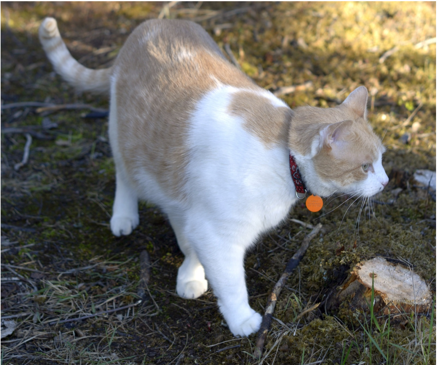
(right side profile)