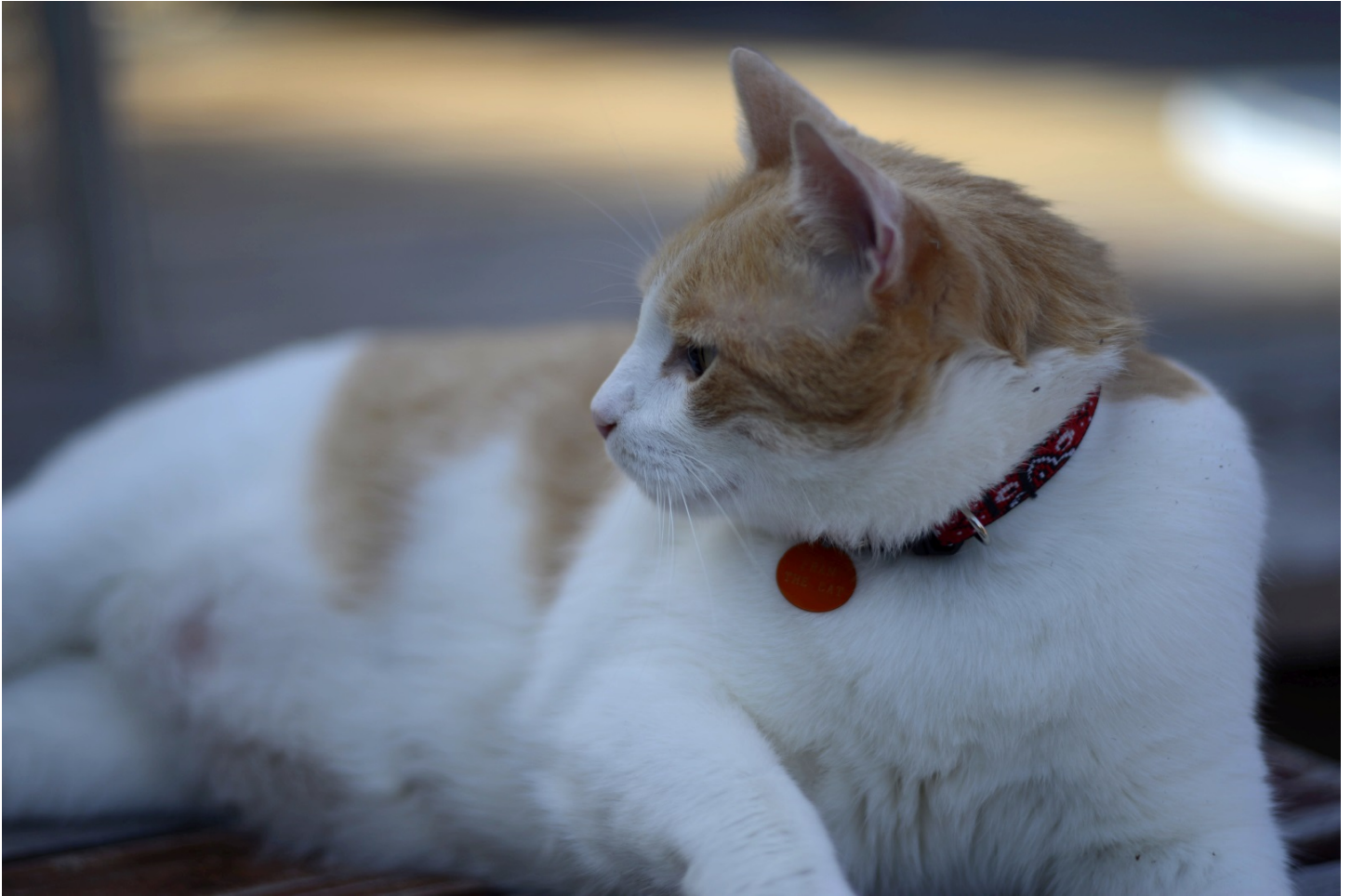
(left side profile)