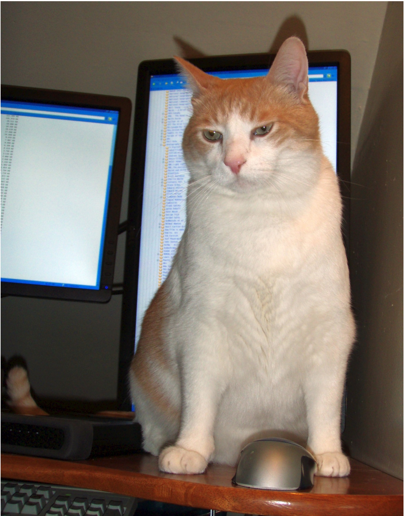
(komputer regulator overlord)